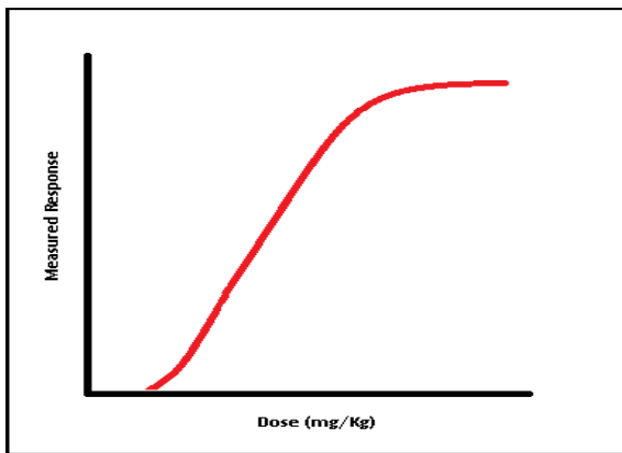
Fig 1: Dose Response Curve